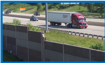
I-39/90/94 at Buckeye Road near Madison.