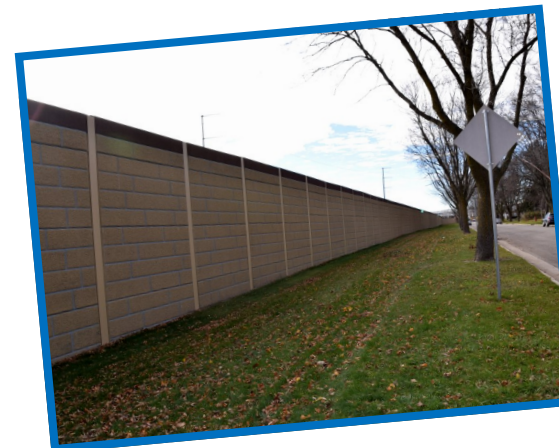
Noise barrier on residential side.

Enclosed are frequently asked questions about noise barriers and their answers. This will help you understand WisDOT policy for installing noise barriers and how adjacent landowners and residents are involved.