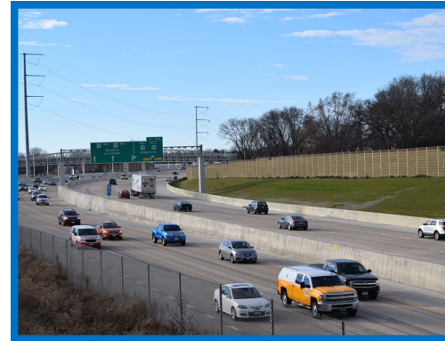
Madison Beltline (US 12/14) at Seminole Highway.

A. The Traffic Noise Model (TNM 2.5) ® is used to predict future traffic sound levels. Impacted locations are then considered for noise abatement measures. Project staff evaluates potential design and traffic control modifications, such as prohibiting trucks or changing the horizontal or vertical alignment. Then, noise barriers are modeled for attenuating noise and are optimized to ensure a beneficial and economical barrier is designed. After the evaluation, a determination is made whether each barrier is a reasonable and feasible mitigation measure.