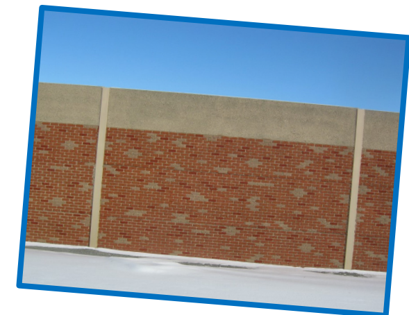
I-41 in Green Bay.