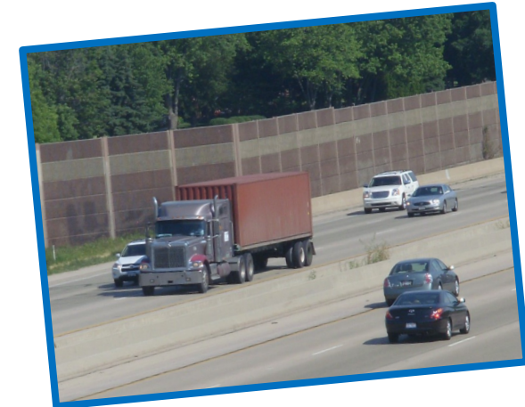
I-39/90/94 at Cottage Grove Road near Madison.

Here's a sampling of noise barriers in Wisconsin communities.